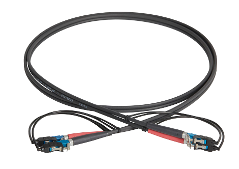
2XSM MIL LCUPCMIL LCUPC

Regardless of length, type of fiber, choice of connectors or cable construction, we manufacture according to your wishes. We have the capacity to manufacture both large and small volumes, using our cables or specific ones provided by you if needed.